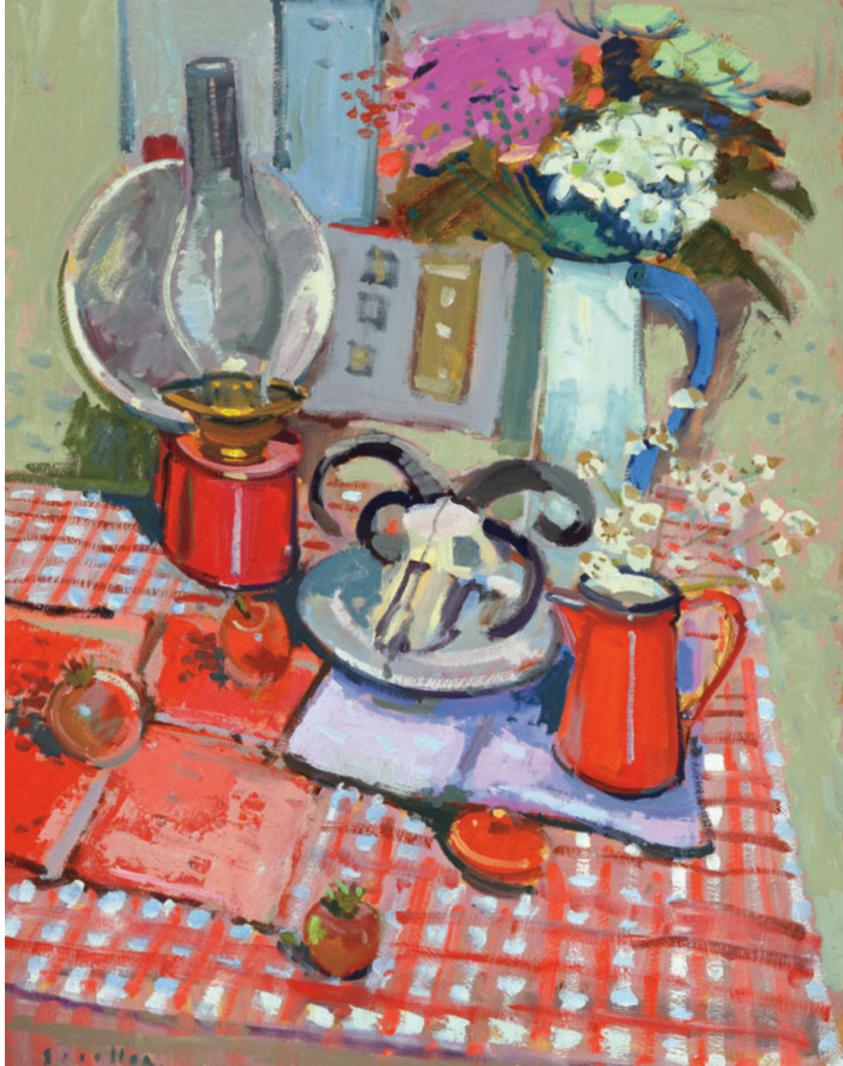
The Checked Cloth oil on panel, 36 x 28 ins