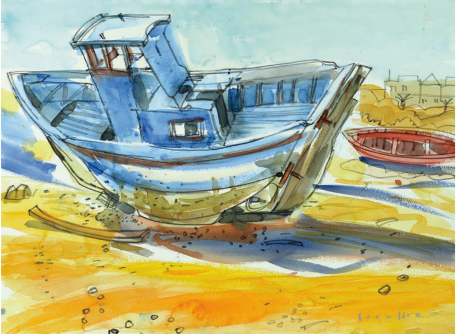
Beached Boat, Santa Luzia watercolour, 20 x 28 ins