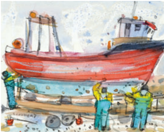
Cleaning the Boat, St Abbs watercolour, 6.5 x 8 ins