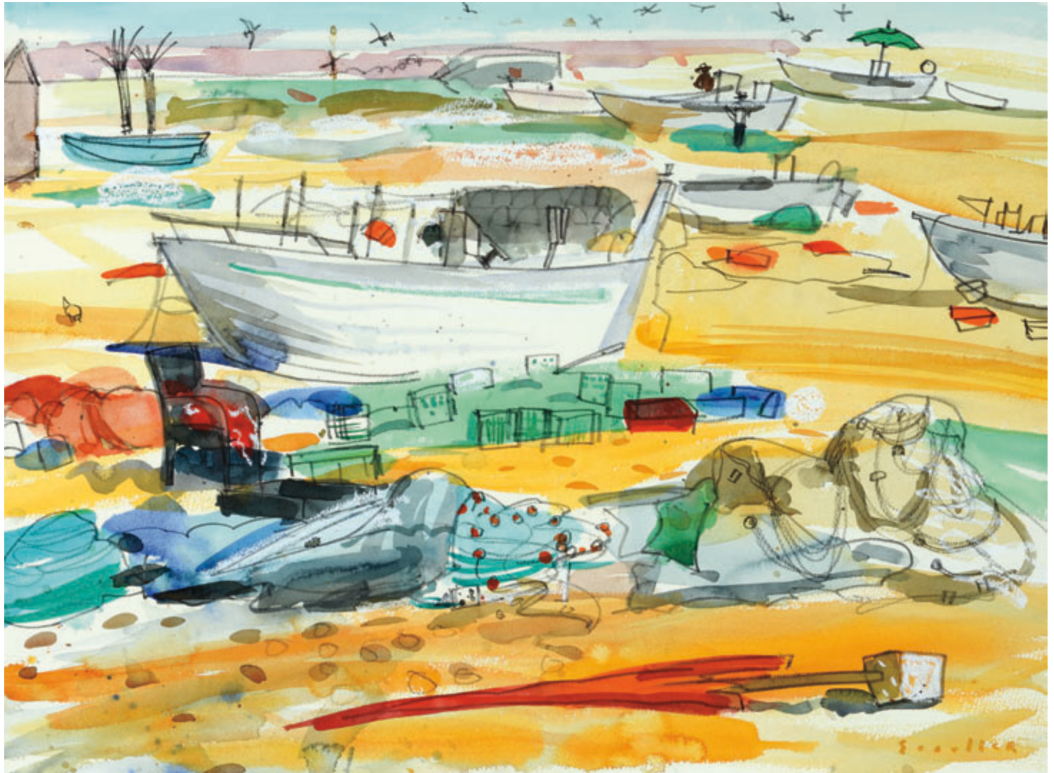
Fishing Paraphernalia, Armação de Pêra watercolour, 20 x 28 ins