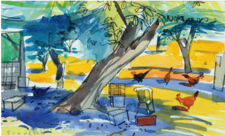
Hens in the Orchard, Bordeira watercolour, 10 x 17 ins