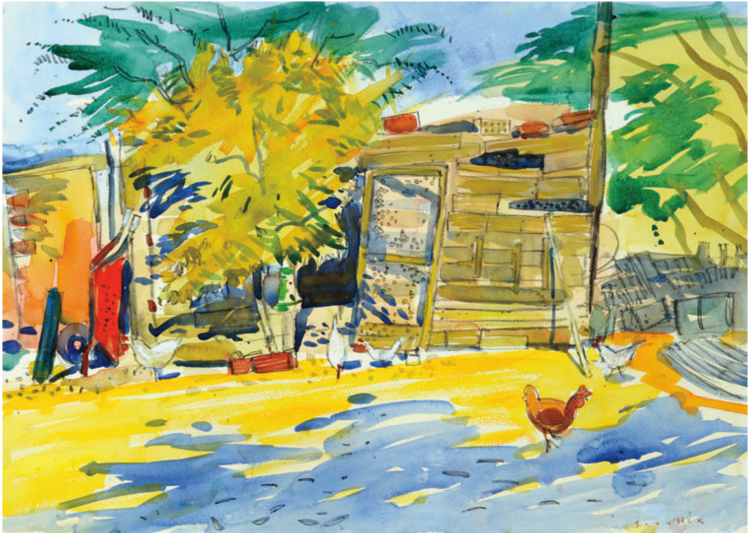
Henhouse, Horta da Raveza watercolour, 20 x 28 ins