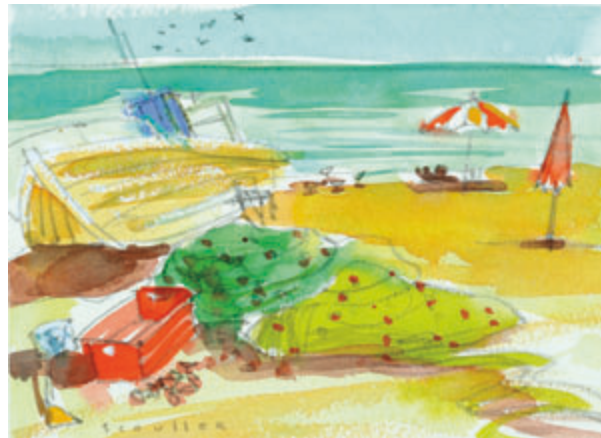
Fishermen's Beach, Armação de Pêra watercolour, 6.5 x 8 ins