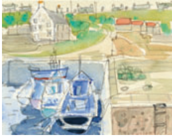
The Harbour, St Abbs