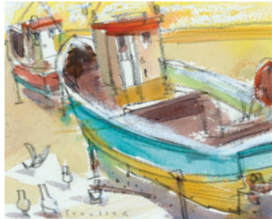
Boats and Seagulls, St Abbs watercolour, 6.5 x 8 ins