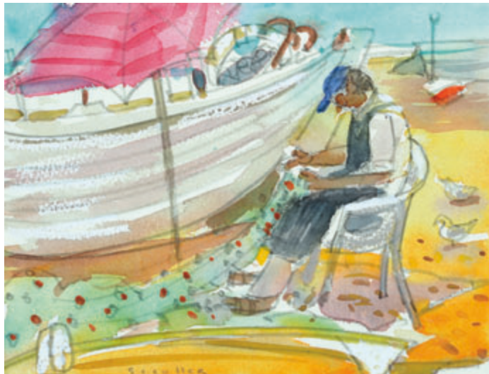
Sorting Nets, Armação de Pêra