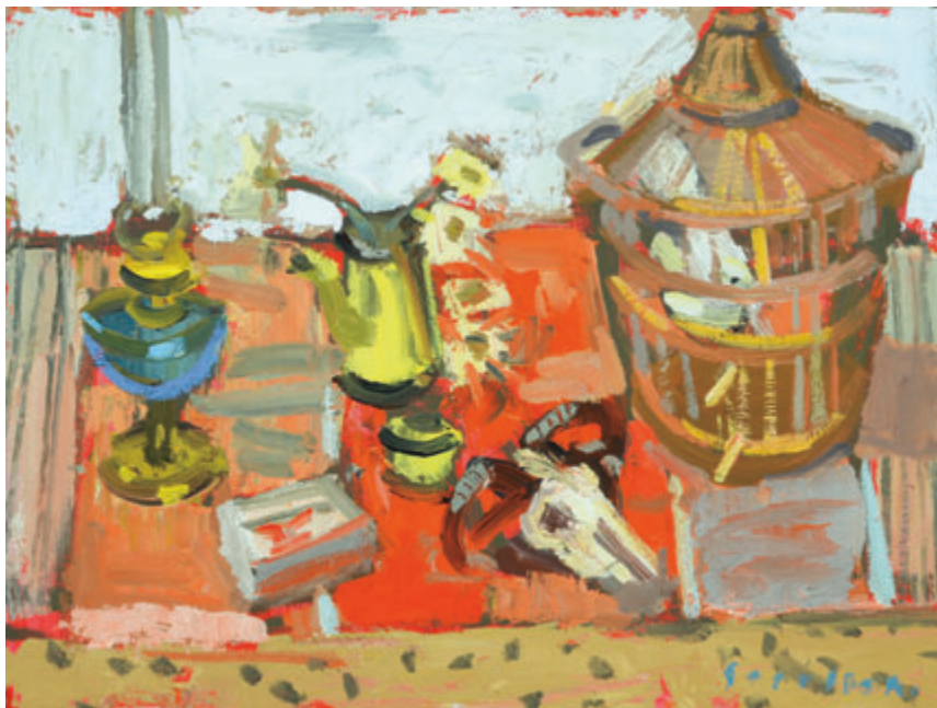
Still-life with Daisies and Dove