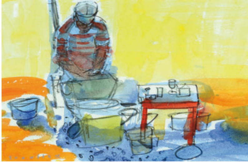
Preparing Fish, Armação de Pêra watercolour, 11 x 17 ins