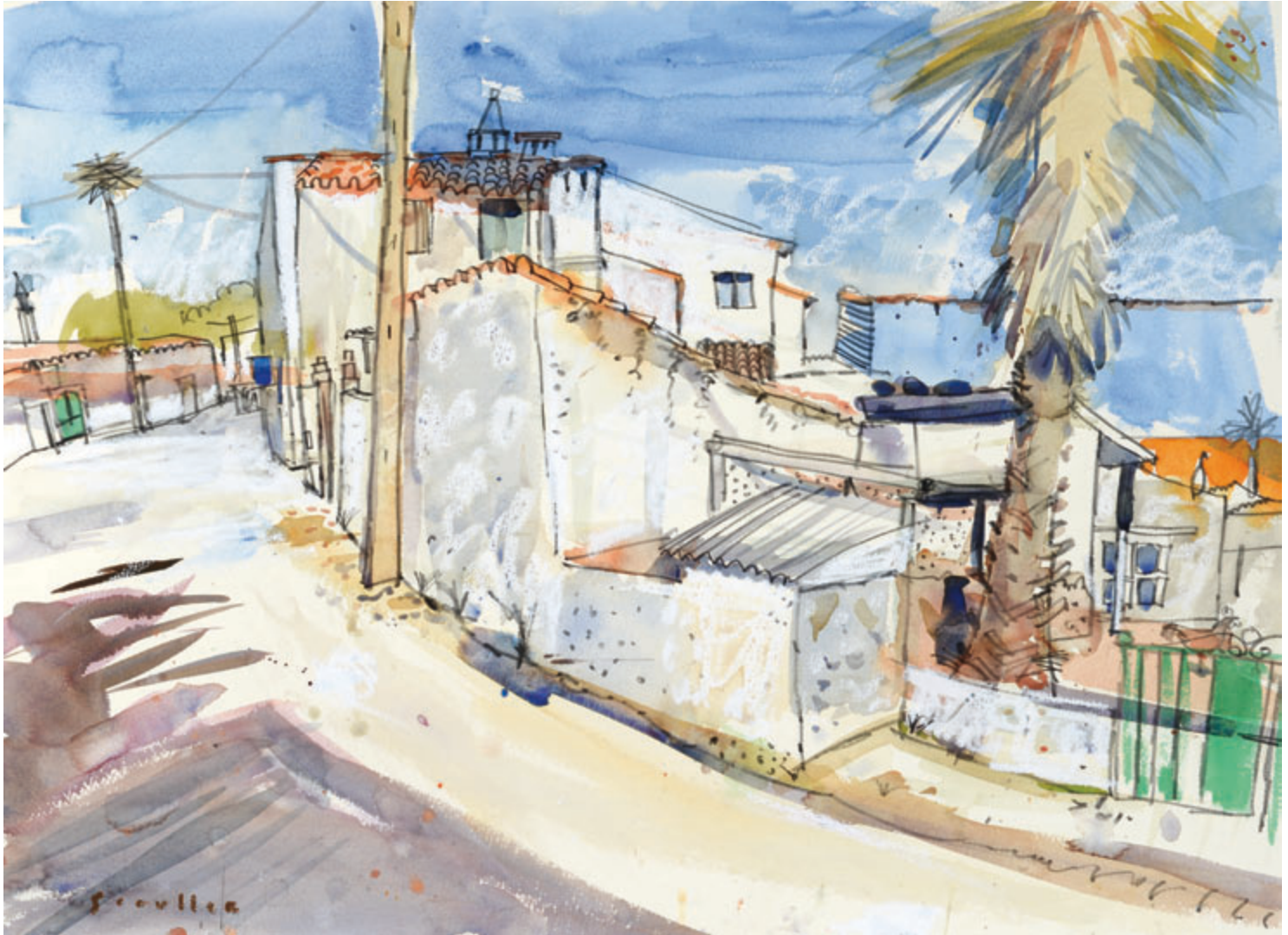
Stork's Nest, Bordeira watercolour, 20 x 28 ins