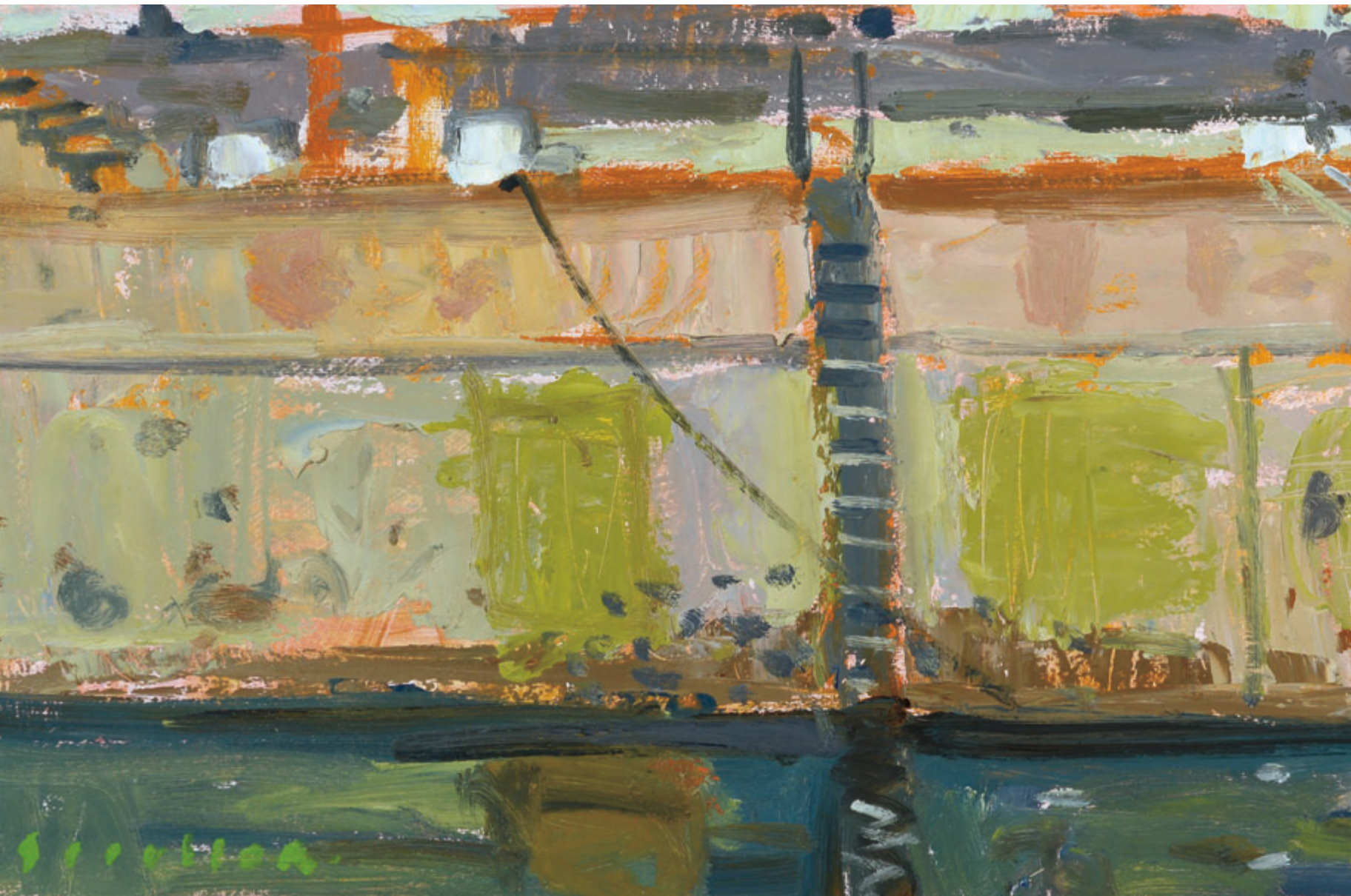
Harbour Wall and Tethered Boats, St Monans