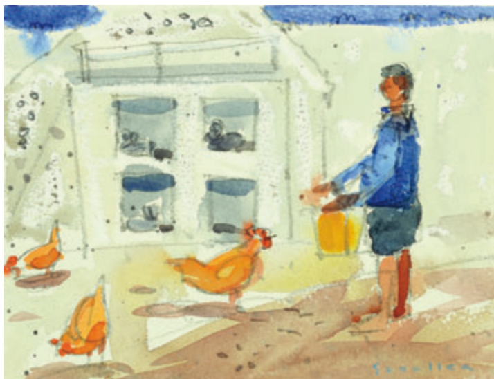
Feeding Hens, Bordeira