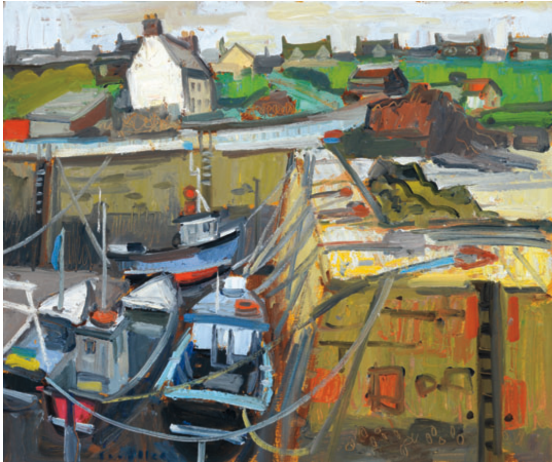
Tethered Fishing Boats, St Abbs