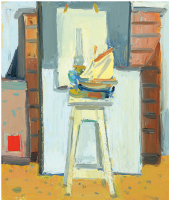
The Marie Louise and Lantern