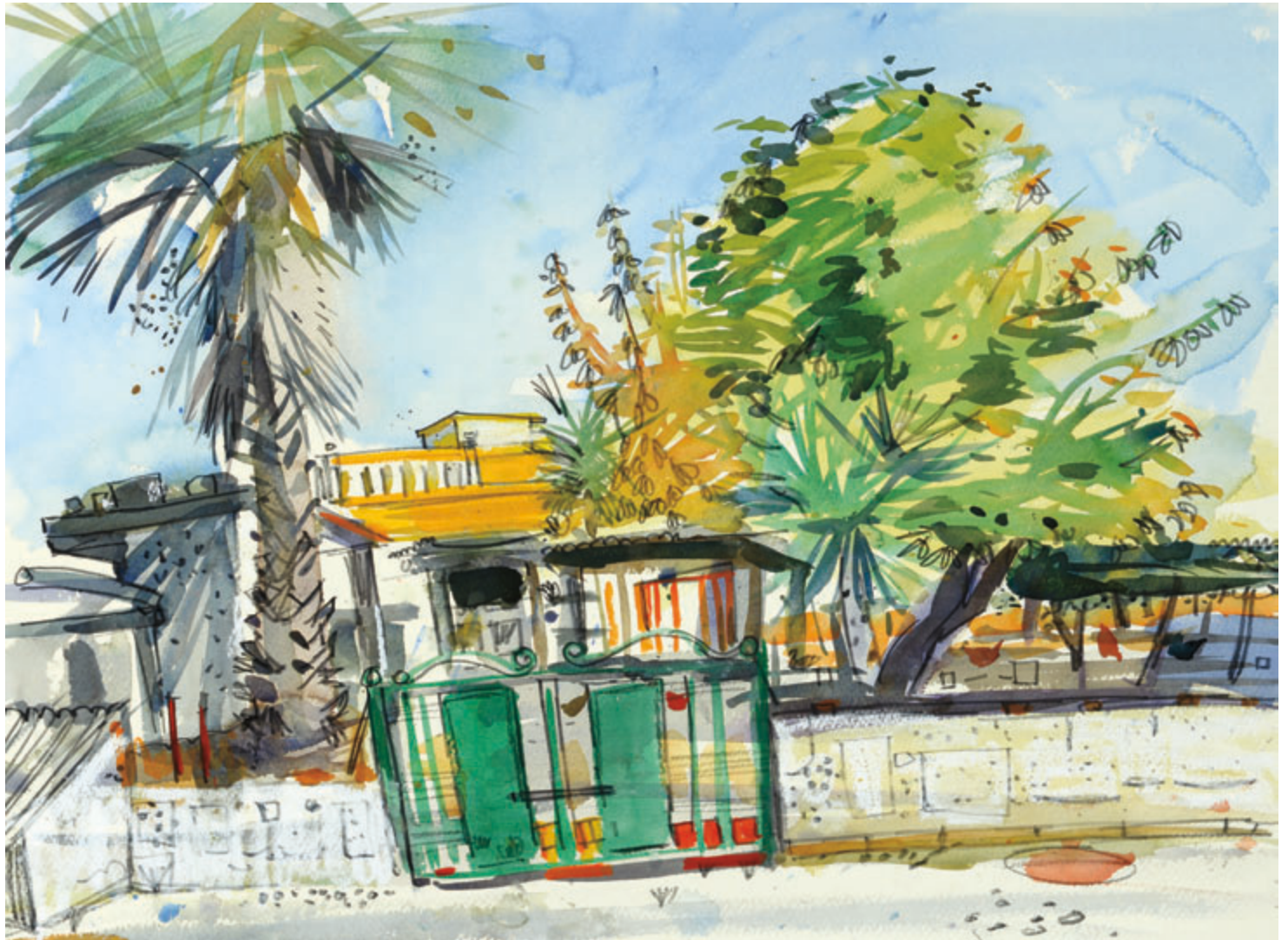
Farm Gates, Bordeira