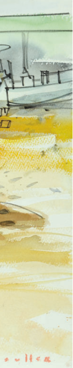
left: Algarve Fishing Boats, Armação de Pêra watercolour, 20 x 28 ins