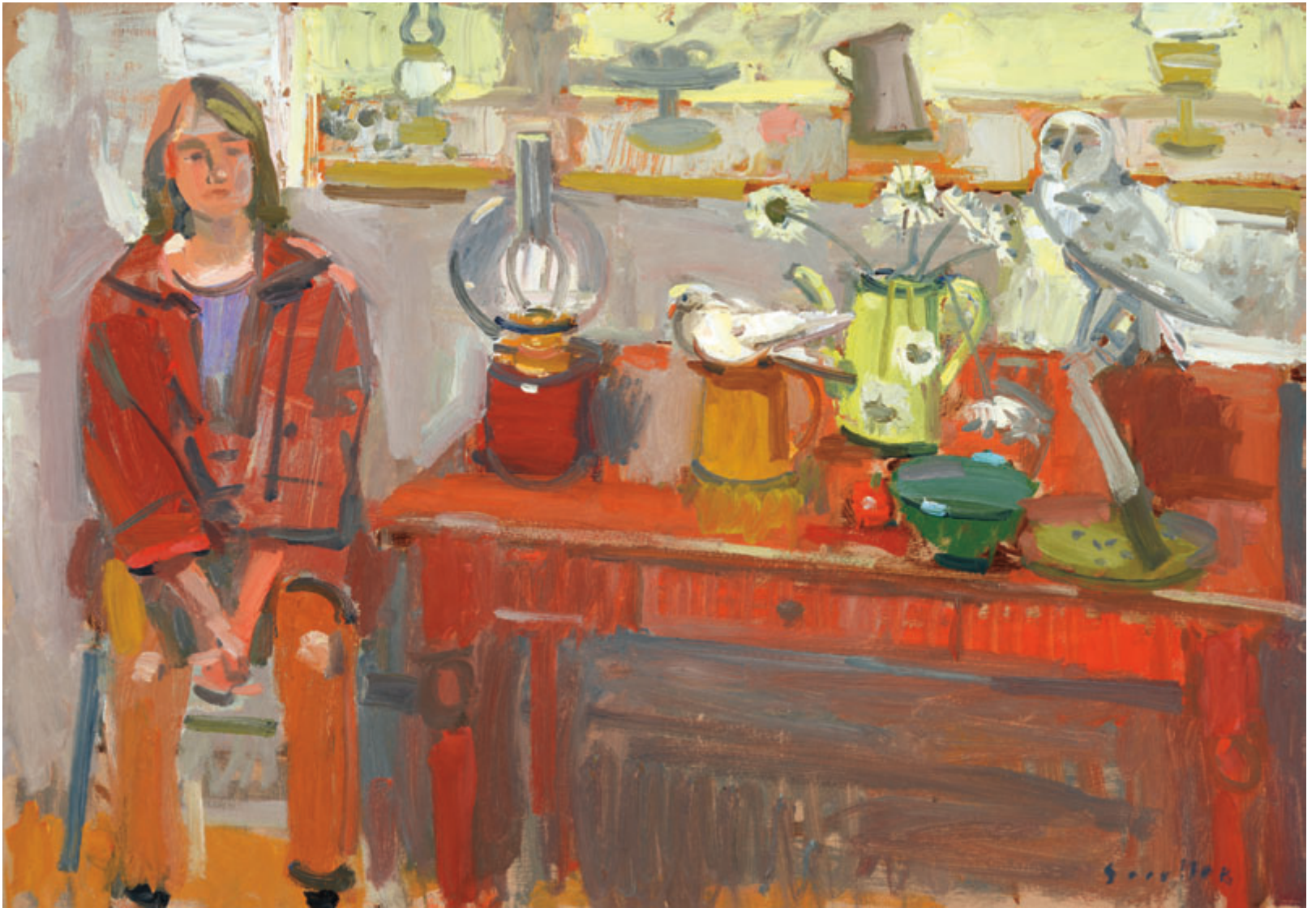
Figure with Still-life oil on panel, 27.5 x 39.5 ins