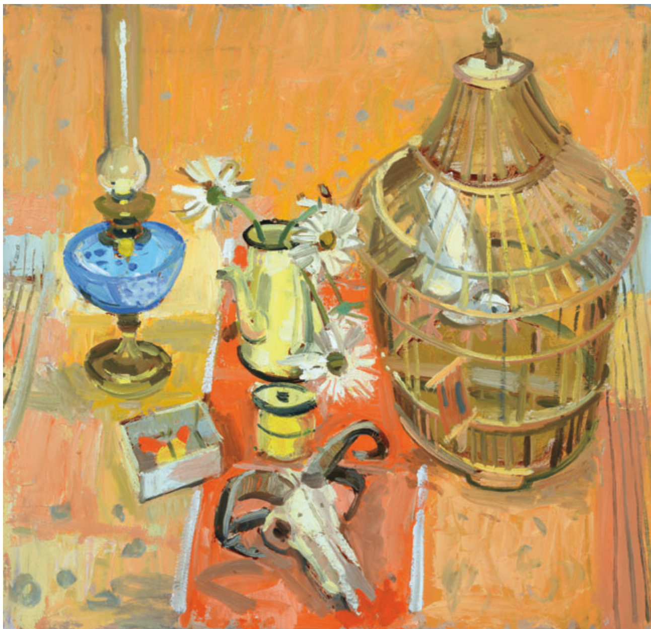
The Lemon Coffee Pot oil on panel, 30 x 32 ins