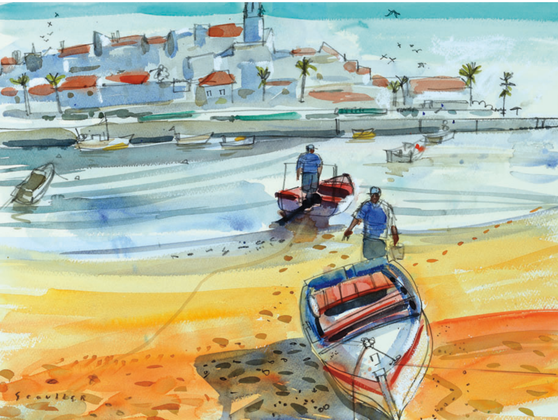
Fishermen, Ferragudo watercolour, 20 x 28 ins