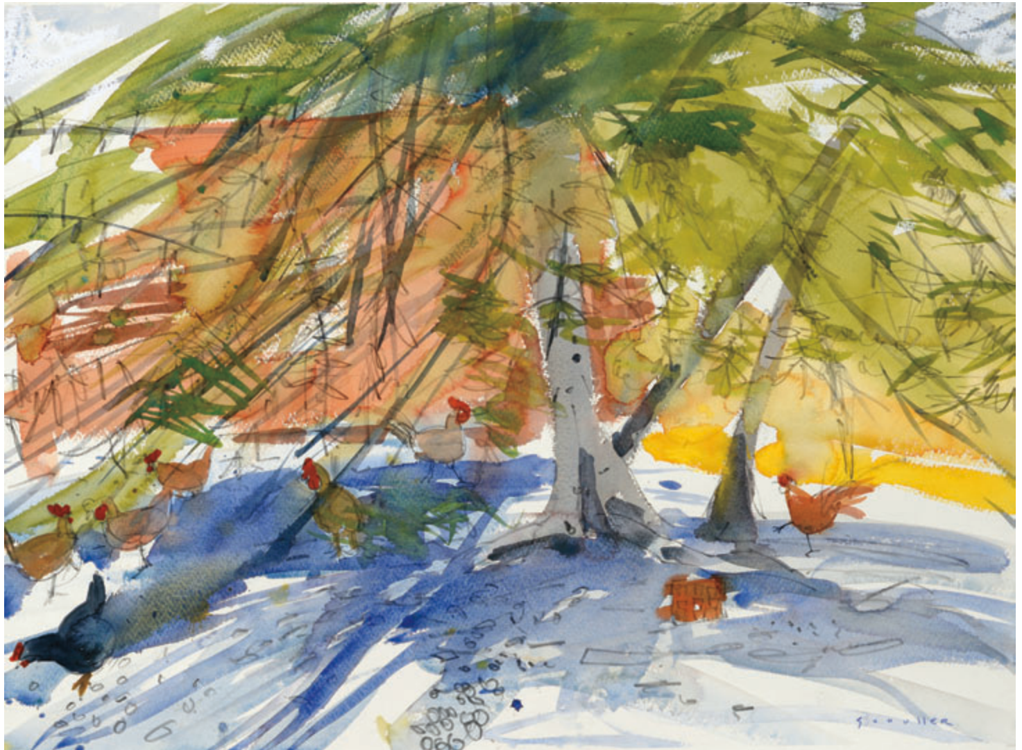
Evening Shadows Falacho