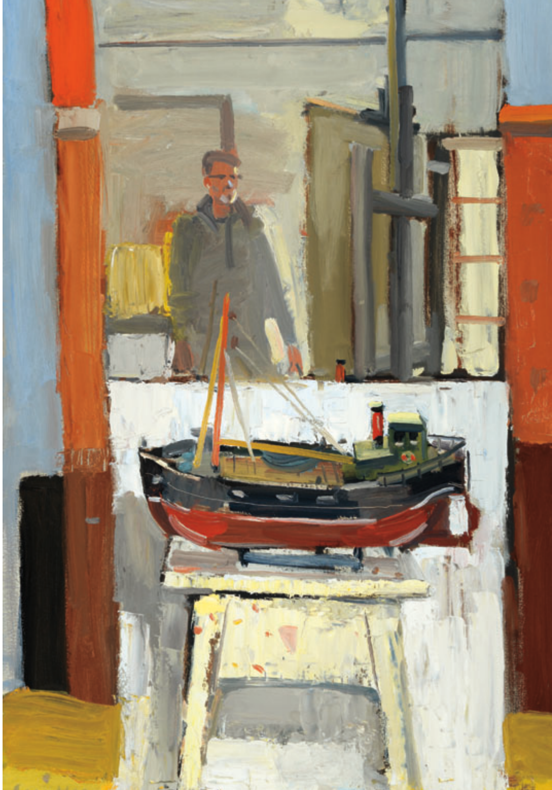
Me and my Clyde Puffer oil on panel, 39.5 x 27.5 ins