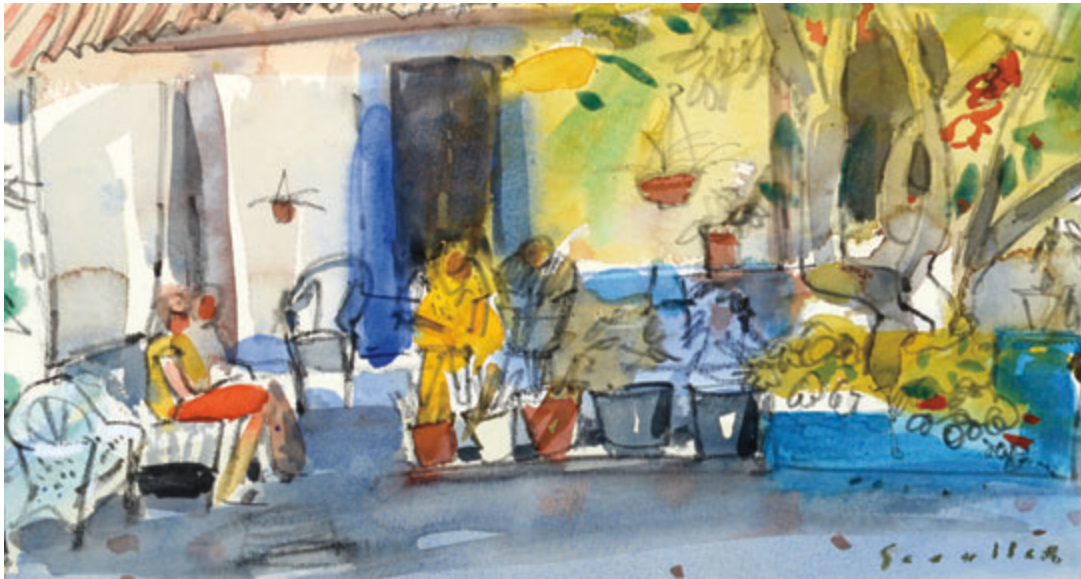
The Conversation, Falacho watercolour, 9 x 16.5 ins