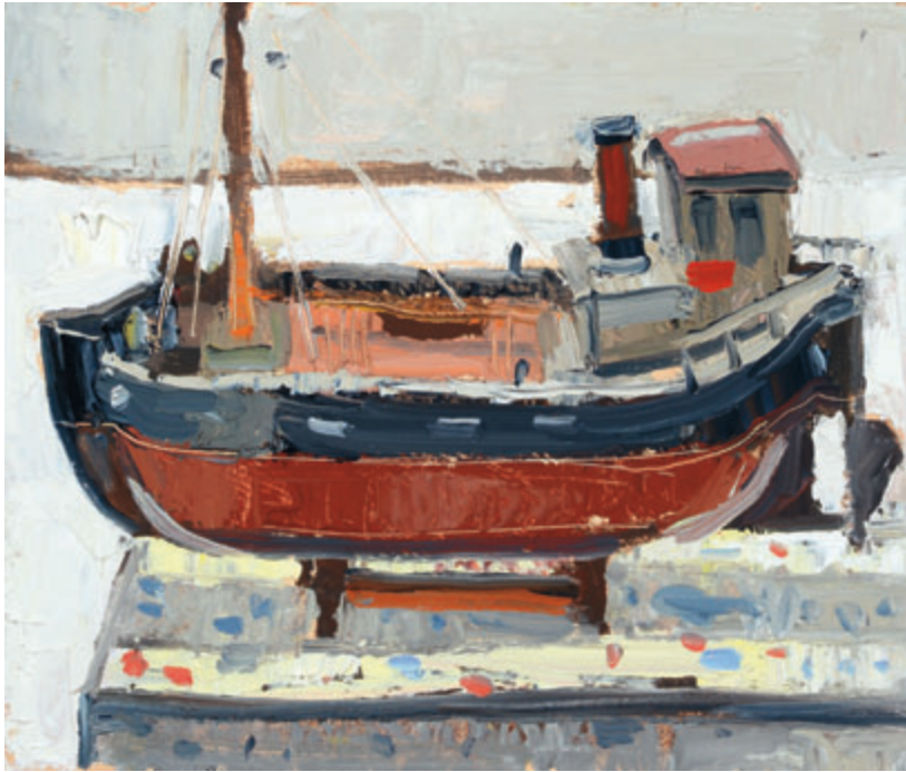
Wee Clyde Puffer oil on panel, 11.25 x 13.25 ins