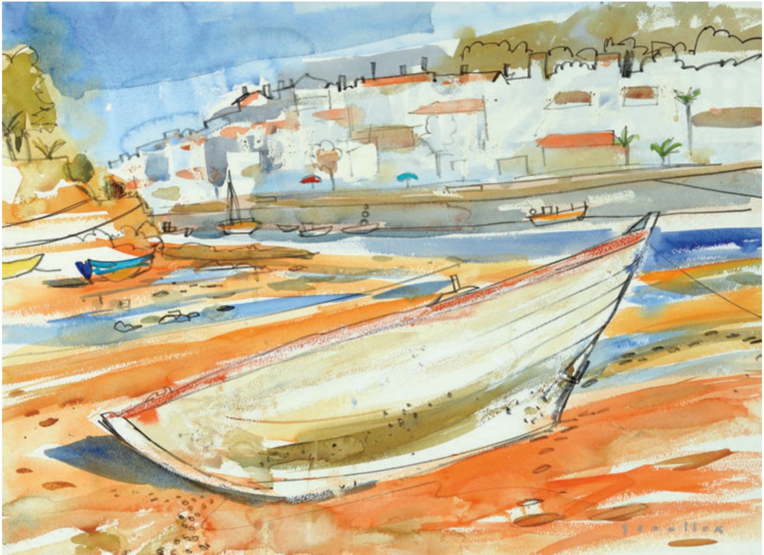
Decaying Boat, Ferragudo watercolour, 20 x 28 ins