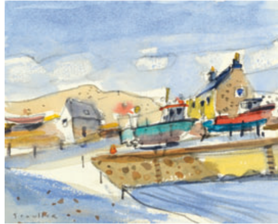
Fisherman's Hut and Boats, St Abbs watercolour, 6.5 x 8 ins