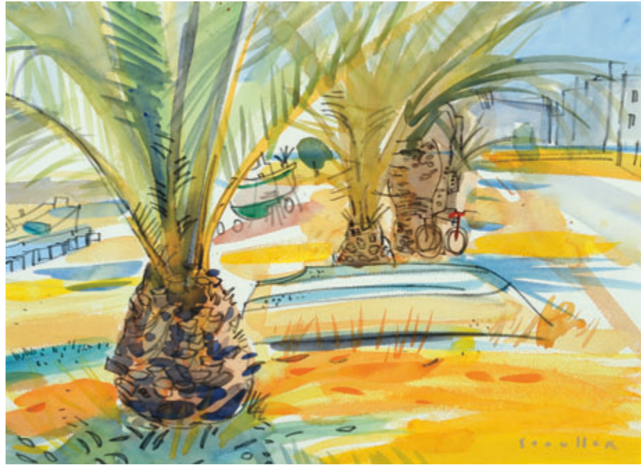
Boats and Palms, Santa Luzia