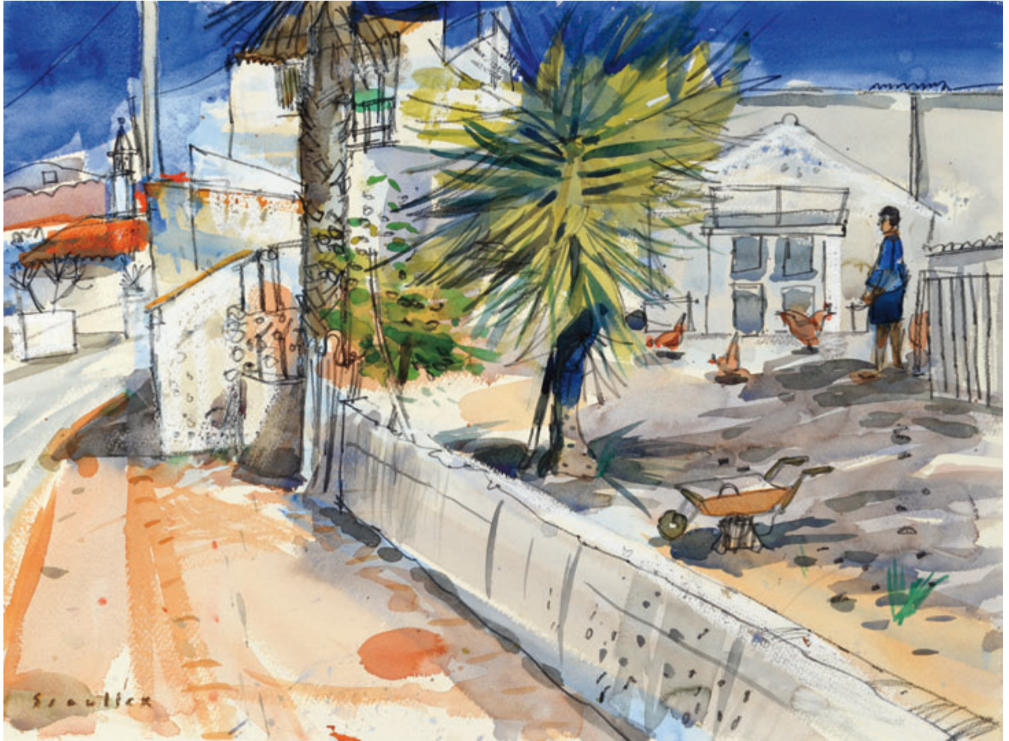
Feeding Hens, Bordeira watercolour, 20 x 28 ins