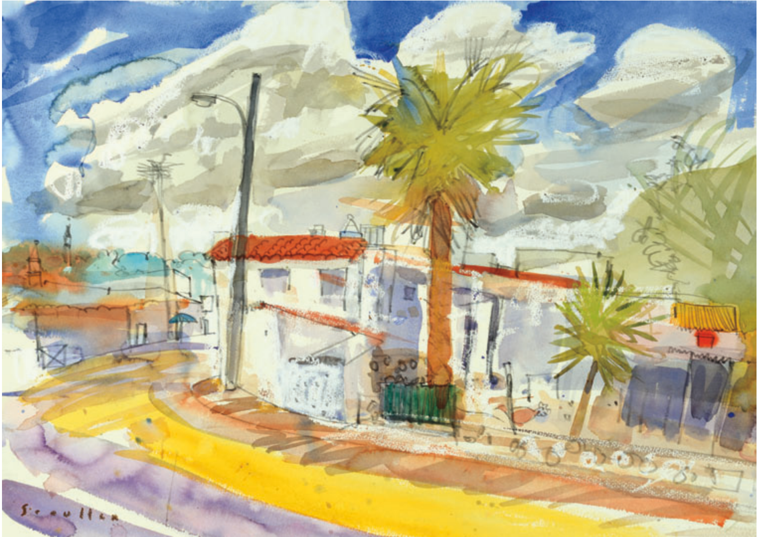
Village Farm, Bordeira watercolour, 20 x 28 ins