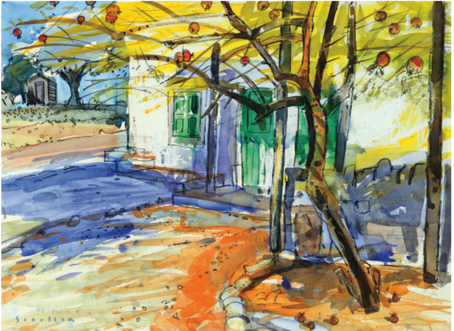
Under a Pomegranate Tree, Palhagueira