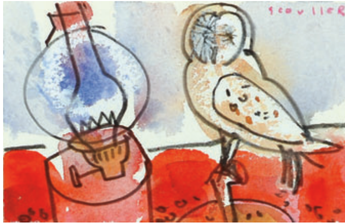
Owl and Lantern watercolour, 3 x 4.5 ins