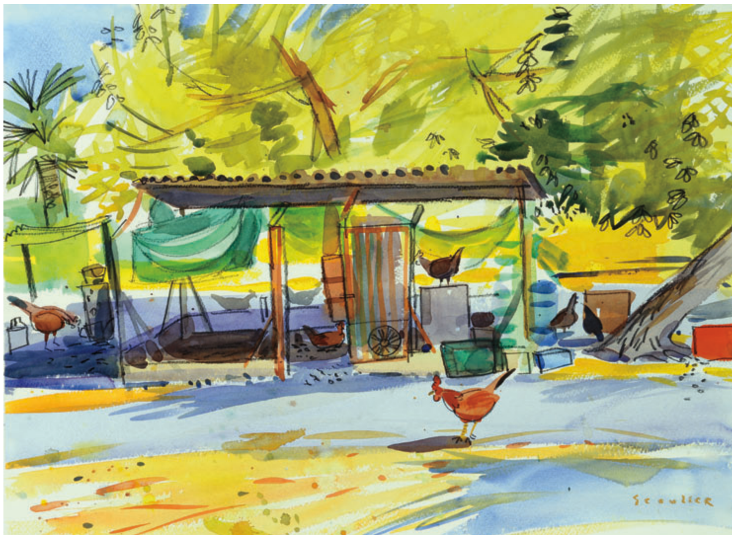
Henhouse, Bordeira watercolour, 20 x 28 ins