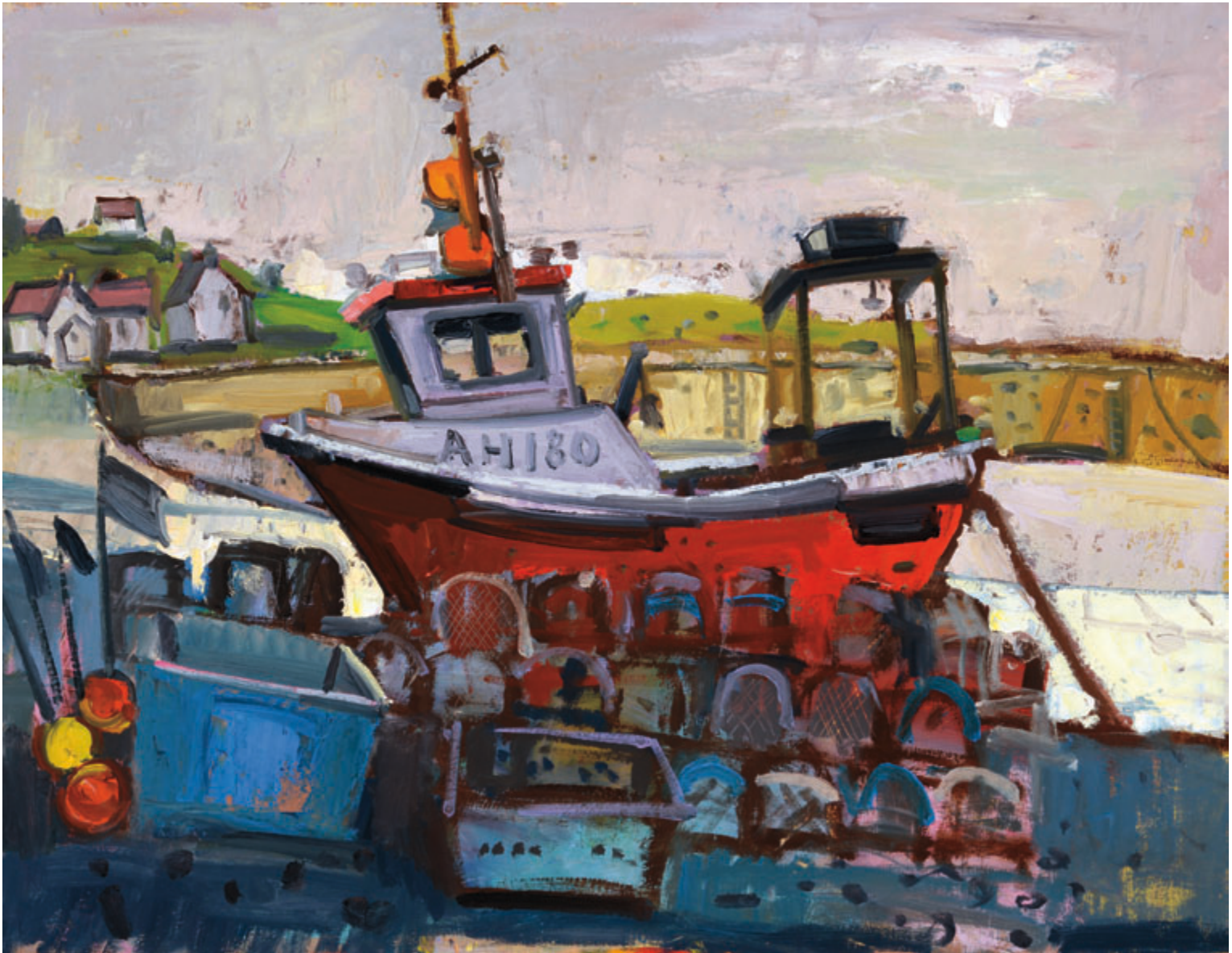
Lobster Boat, St Abbs oil on panel, 28 x 36 ins