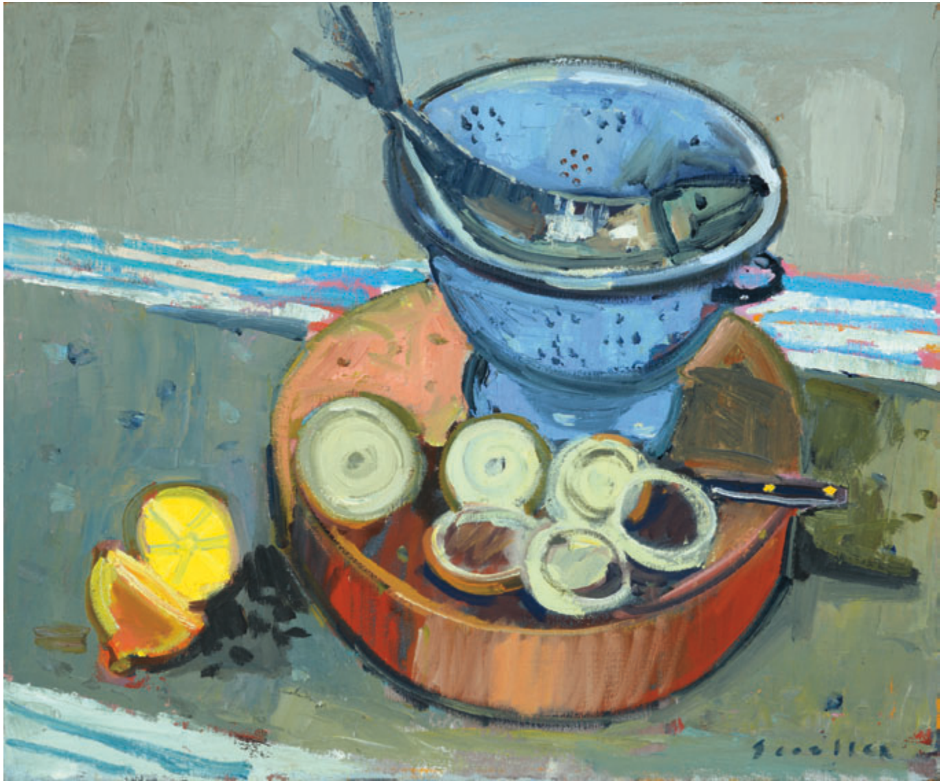
Fish for Tea oil on canvas, 20 x 22 ins