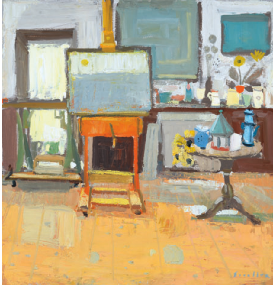
Studio Interior oil on panel, 32 x 30 ins