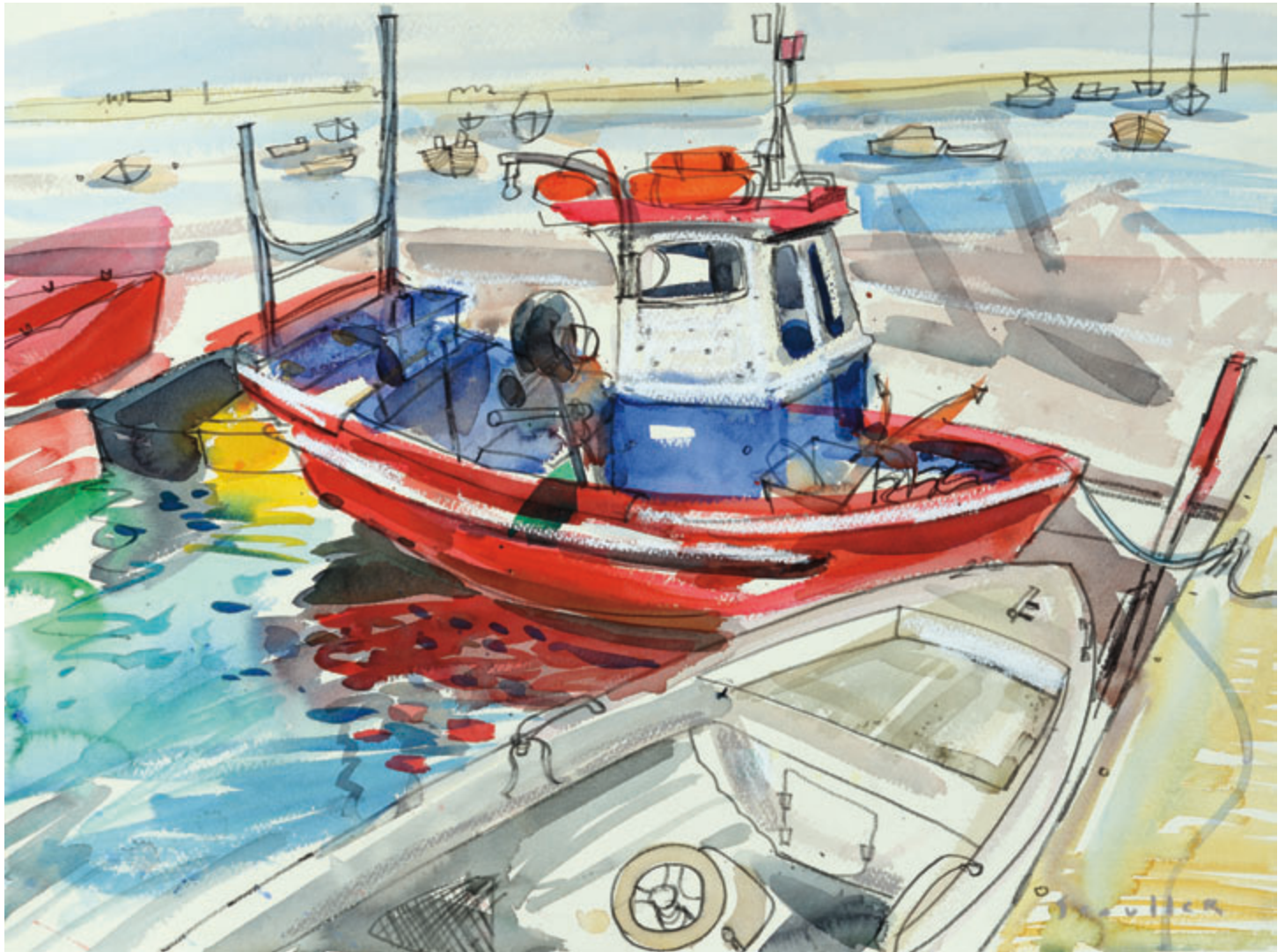
Small Octopus Boat, Santa Luzia