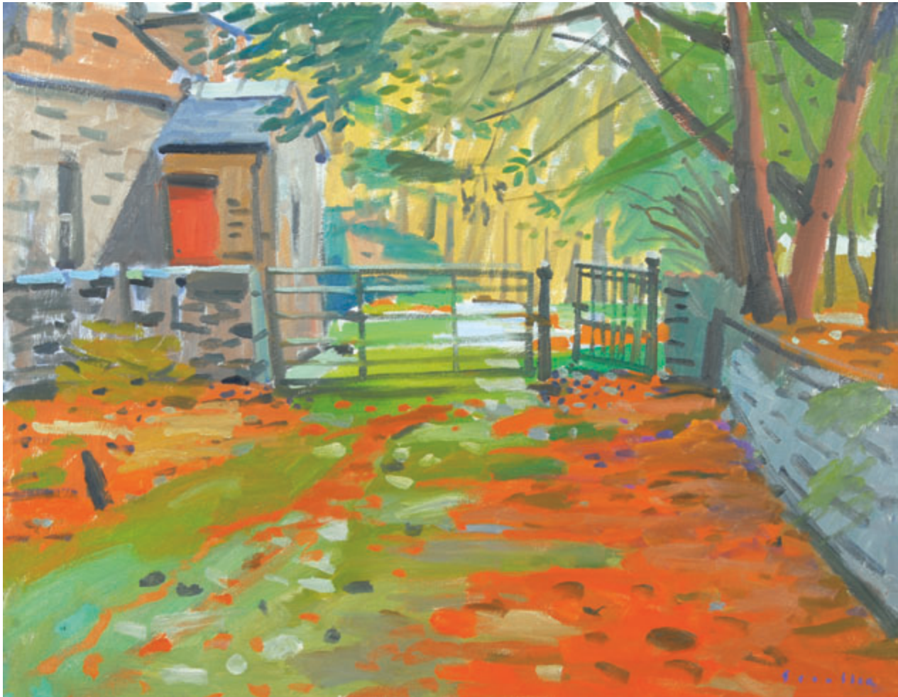
Woodland Gate, Colonsay