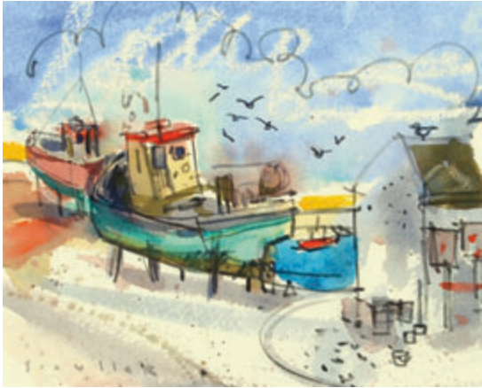
Boats on the Harbour Wall, St Abbs watercolour, 6.5 x 8 ins