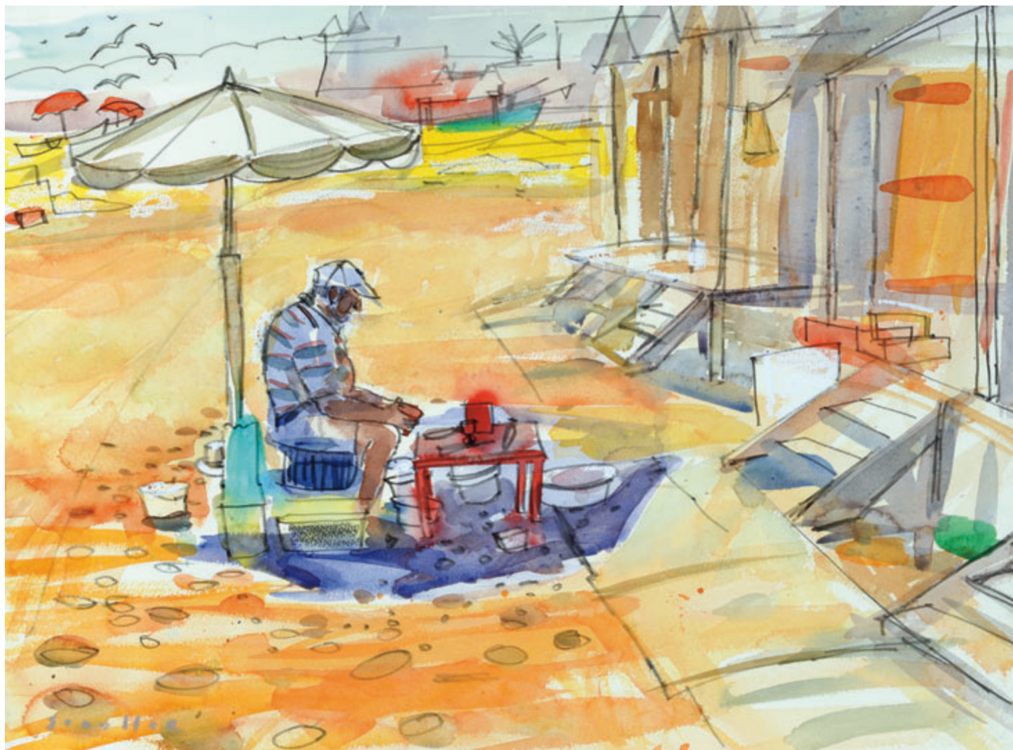
Cleaning Fish, Armação de Pêra