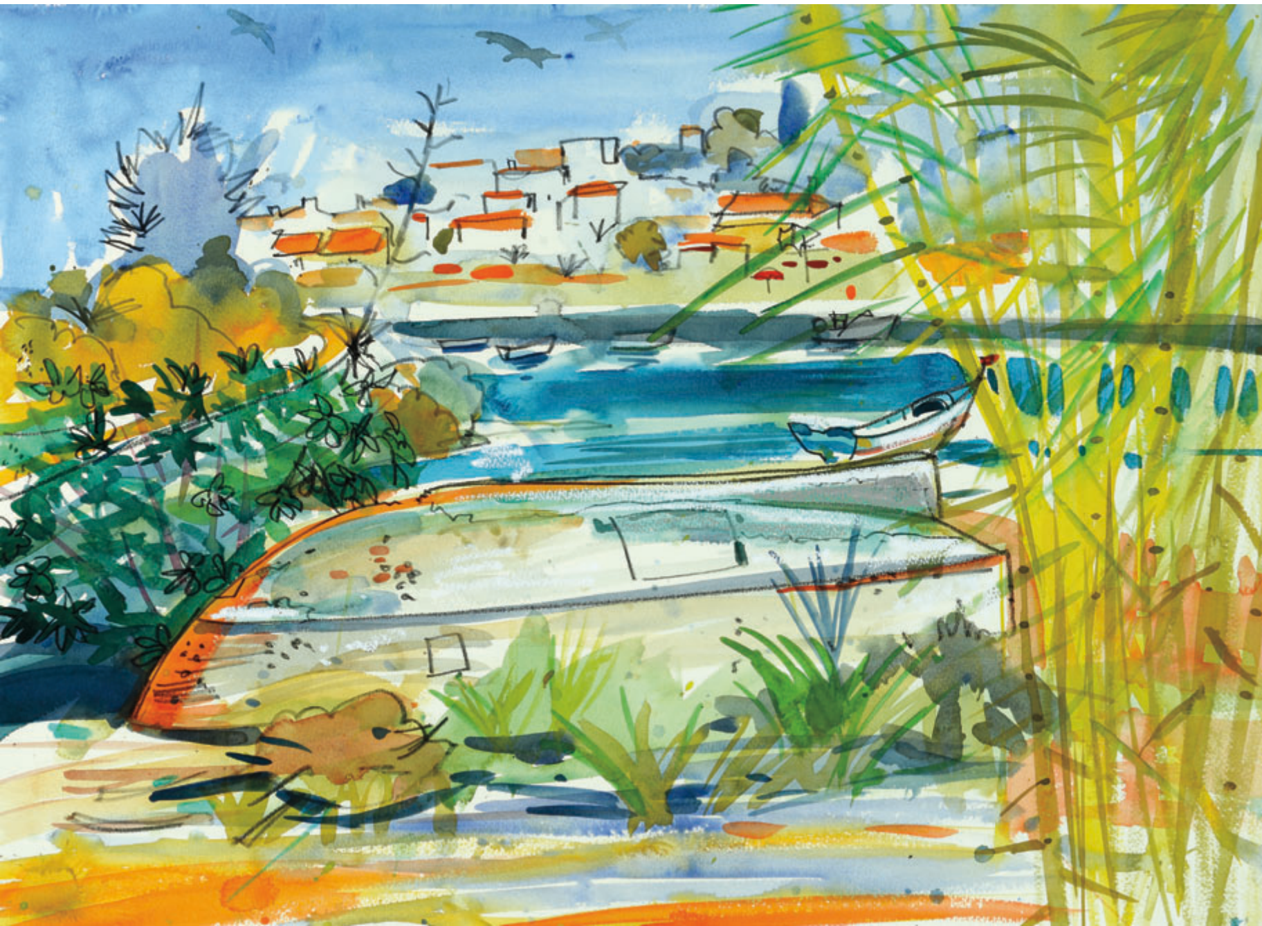
Upturned Boat, Ferragudo