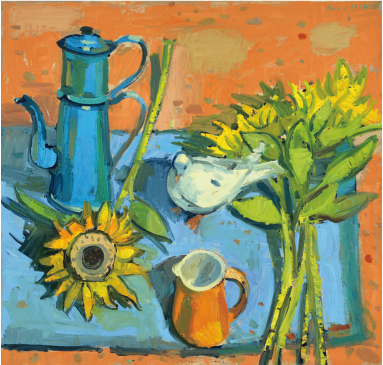
Vintage Coffee Pot and Sunflowers oil on panel, 30 x 32 ins