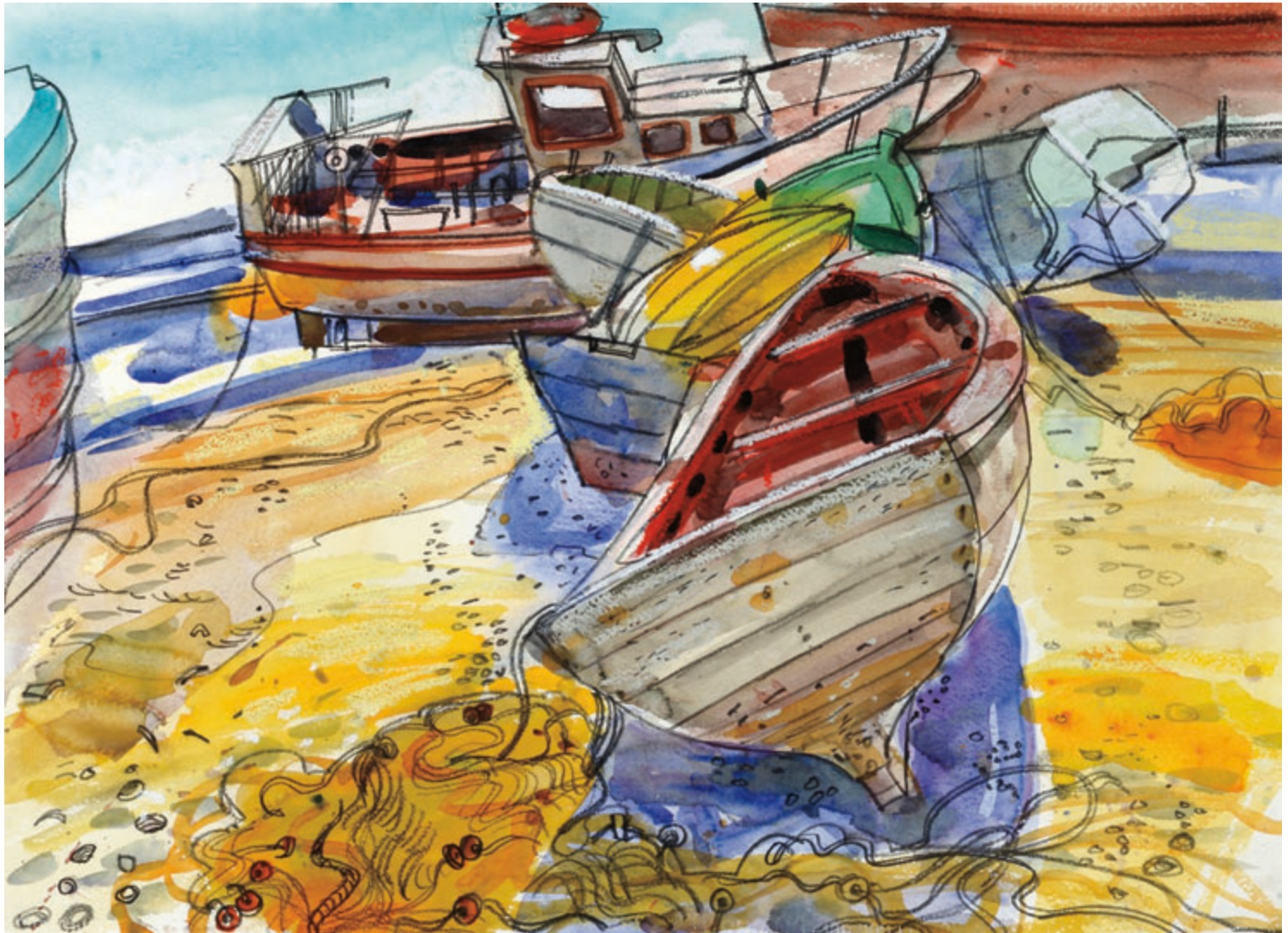
Boatyard, Santa Luzia watercolour, 20 x 28 ins