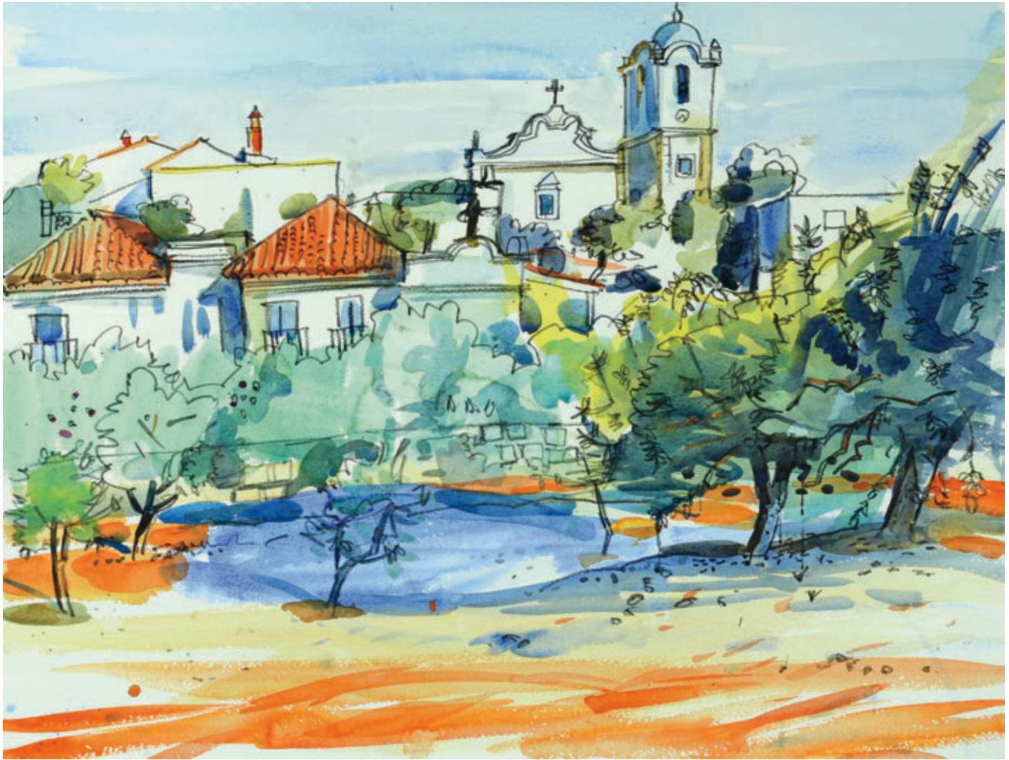
The Old Church, Santa Barbara de Nexe